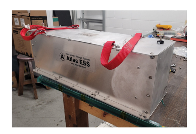
An Atlas ESS enclosure configured to fit the battery bay in the genie lift.