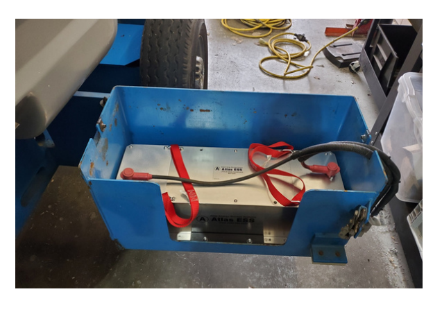
Battery pack installed on both sides of the genie lift as it requires one battery per side providing a total capacity of 14.4 kWh.