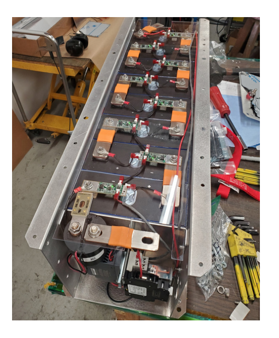
Battery back during assembly process using lithium-ion phosphate modules with a total of 7.2 kWh capacity.