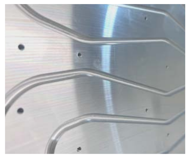
Cooling Plate - Interior

Shipping delays pushed the arrival of the EcoPower modules and hindered the project team's ability to assemble a prototype battery before the end of the project. In efforts to make the most out of the project, the team agreed to designing the battery pack's cooling plate, which prevents overheating, with the time that was allocated to assembling and testing the prototype pack.