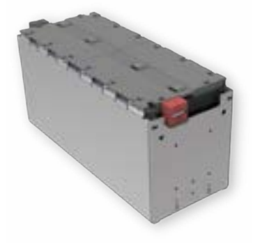
277Ah 1P12S modules of EP-LPF from EcoPower

We carried out a study on various medium-duty trucks (MDTs) to identify the typical design and dimensions of the ladder frame of the truck's chassis. The powertrain system model of CanEV e-MDT was built to access its performance and range using different numbers of LFP battery modules and pack designs. The battery pack consists of 8 EcoPower EP-LFP 277Ah 1P12S battery modules that provide a total of 309V nominal voltage with 81.7kWh and can be mounted and safely protected between the truck's ladder frames. Two additional modules can be mounted under the cab.