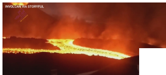
Incredible video of lava river flowing from La