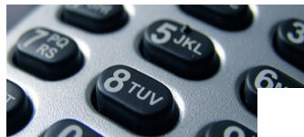
B.C. couple could lose $500K in hang-up delay