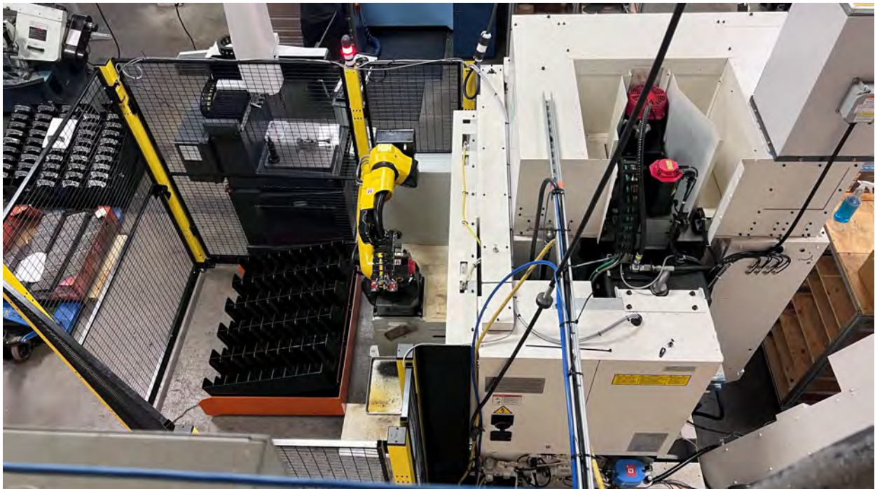
Bird's eye view of Fanuc Robodrill, Robotic cell and CMM

Thanks to all these combined efforts, we have a perfectly functioning robotics cell that would have not been possible without the attention to detail and hard work at both Elliot Matsuura and Agile Robotic Systems. This being our first experience with robotic automation, it has been very positive, and we cannot wait to see how we can implement this technology in different efficient ways."