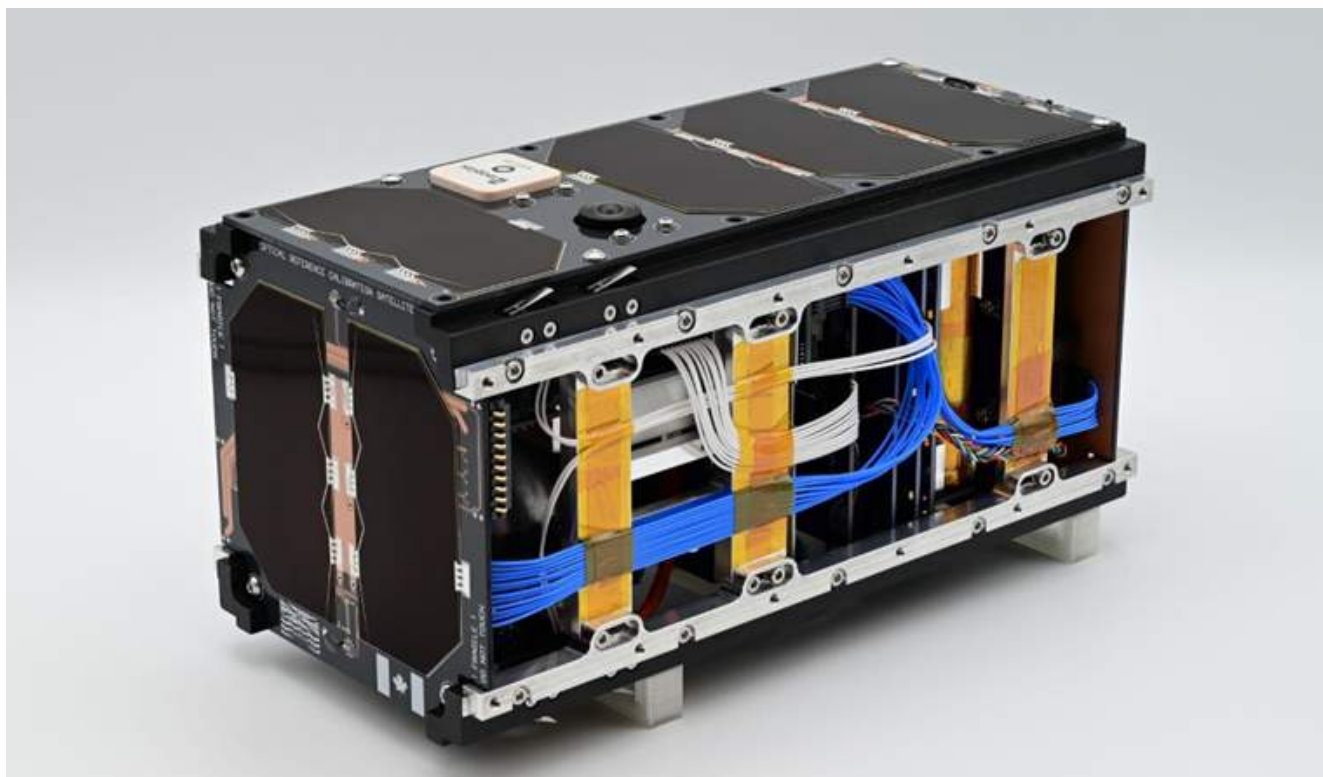
Final assembly of the spacecraft with a solar panel removed.

This light source will also help demonstrate that photometric reference calibration can be performed with better precision than previous methods. In addition to the payload ORCASat is carrying, it will demonstrate the complete end-to-end operations for missions of this nature, including precise scheduling of the light source illumination, collecting of measurements, data downlink, and data distribution.