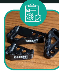
CONTRACT MANUFACTURING SERVICES