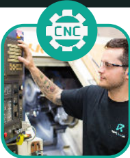
CNC MACHINING SERVICES